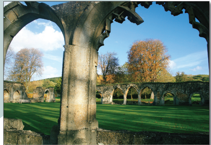
Cloisters tracery, Hailes Abbey